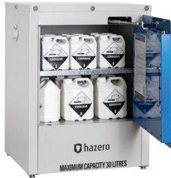
Hazero Corrosive Liquid Cabinet - 30L Product code 41-0801