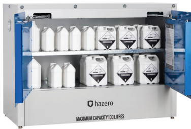
Hazero Corrosive Liquid Cabinet - 100L Product code 41-0803