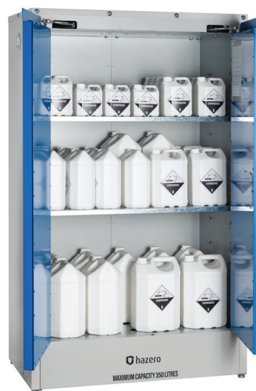
Hazero Corrosive Liquid Cabinet - 350L Product code 41-0806