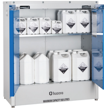
Hazero Corrosive Liquid Cabinet - 160L Product code 41-0804