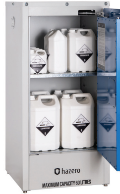
Hazero Corrosive Liquid Cabinet - 60L Product code 41-0802