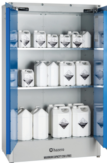
Hazero Corrosive Liquid Cabinet - 250L Product code 41-0805